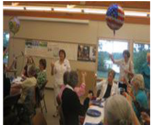
A toast to the League!