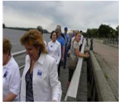
All Aboard the Ecotour!