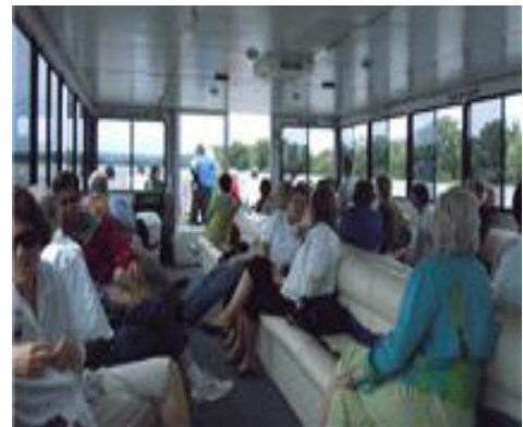
Enjoying a cruise on the Mississippi